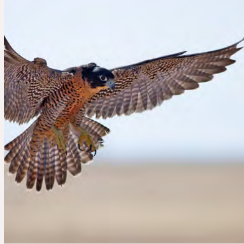
In Balance with Community and Nature