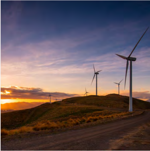
Independence and Pioneering