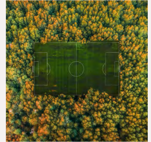
Thinking Out of the Box